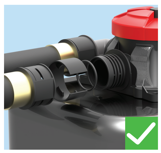
2 Quick-Connect connections