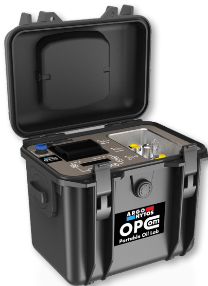
OPCom Portable Oil Lab